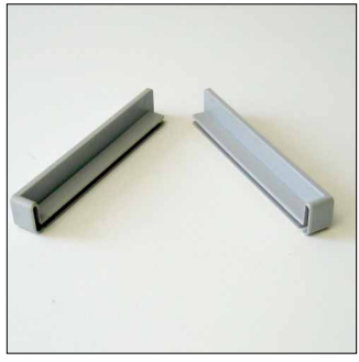
HD SnapFit<sup>tm</sup> modular Endcaps for 5" shelf

When drilled the shelf becomes a custom parts caddy. It is an excellent solution for: Tools Kitchen gadgets Machined parts Collections