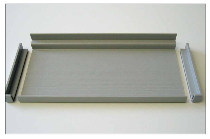
Endcaps create a tray and provide a finished end for the shelf.